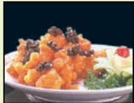
1. Crispy Shrimp with Walnuts 14.95 2. Crispy Chicken with Walnuts 13.15