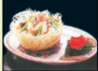
1. Seafood in a Bird's Nest 14.95 2. Chicken in a Bird's Nest 12.95