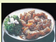
1. Sesame Chicken (white meat) 12.45 2. Sesame Beef 13.95