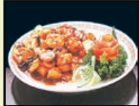
Scallops and Shrimp with Garlic Sauce 13.95