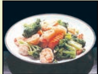
Chef's Shrimp 13.65