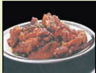
General Tso's Chicken 12.45