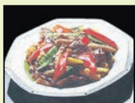
1. Rainbow Steak 13.95 2. Rainbow Chicken 12.15